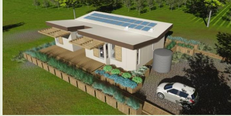
3D rendering of UC Davis' entry into the 2015 Solar Decathlon competition. Original image can be viewed here .